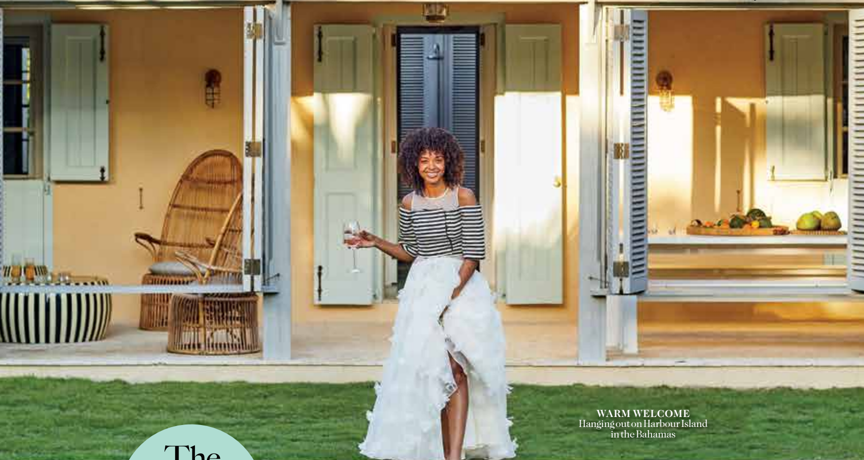
WARM WELCOME Hanging out on Harbour Island in the Bahamas